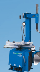
MONTY® 1270 SMART