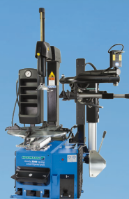
MONTY® 3300 RACING SMARTSPEED™ / GP PLUS