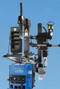
MONTY® 3300-24 SMARTSPEED™ / GP PLUS