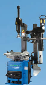
MONTY® 3300-20 SMART PLUS / GP PLUS