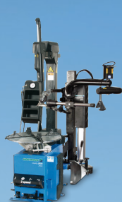
MONTY® 3550 SMARTSPEED™ / GP PLUS

The monty® series presents a winning combination of traditional design and cutting-edge features that enhance productivity and prevent damage. It is an ideal addition to smaller, independent shops that cater to a diverse range of wheel and tyre combinations. The on-floor bead breaker, conveniently operated through an ergonomically located pedal, ensures the effortless and safe breaking of even the hardest beads. The monty® series offers a suite of functions that simplify the process of changing ultra-high performance and run-flat tyres. Incorporating a blend of traditional design and modern productivity-boosting features, the monty® series is a highly recommended addition to any shop, promising enhanced efficiency and performance.