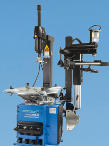
MONTY® 3300-22 SMARTSPEED™ / GP PLUS